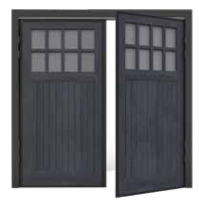
Shildon Woodgrain | Ebony