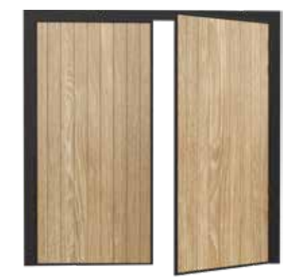
Virginia Woodgrain | Bleached Oak