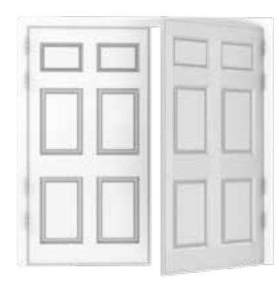
Lydbrook Woodgrain | Gloss White