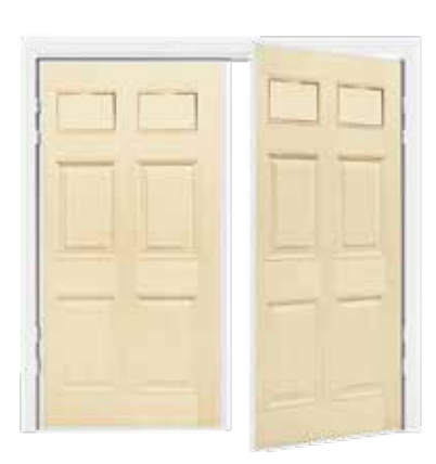
Glossop Gloss | Gloss Magnolia