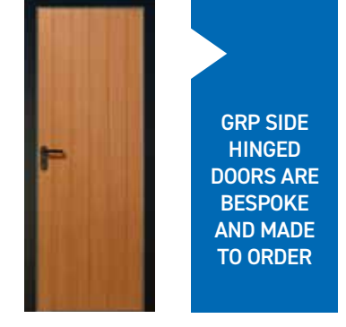
Virginia Glasswood Personnel | Teak