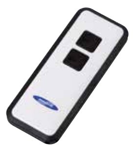
Mini-Novotron 522 hand transmitter 2-channel, 433 MHz, KeeLoq rolling code

Mini-Novotron 524 Design hand transmitter 4-channel, 433 MHz, KeeLoq rolling code