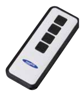
Mini-Novotron 524 hand transmitter 4-channel, 433 MHz, KeeLoq rolling code